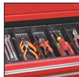
6 Compartment Organizer