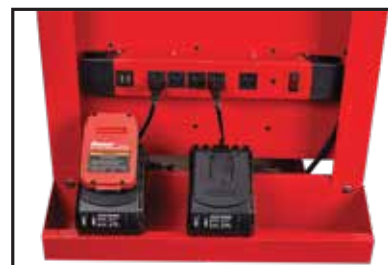
5 Outlet Magnetic Power Strip