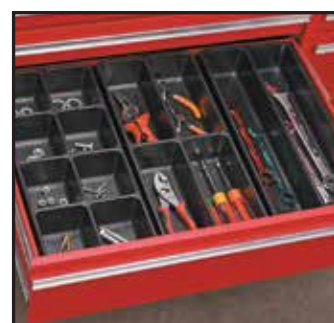
3 Piece, 14 Compartment Organizer Set