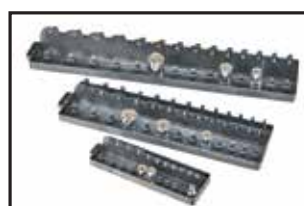
3 Piece SAE Socket Tray/Organizer