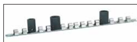
1/2 in. Socket Rail