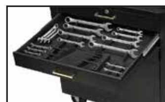
76 Piece Wrench Organizer