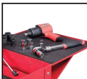
Red Folding Side Tray (Cart Only)