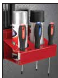
Spray Can and Screwdriver Holder