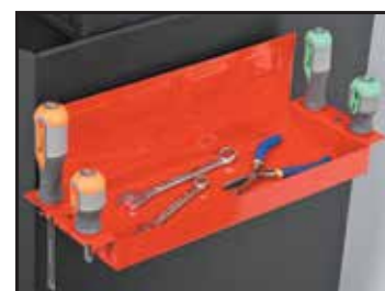
Tray and Screwdriver Holder