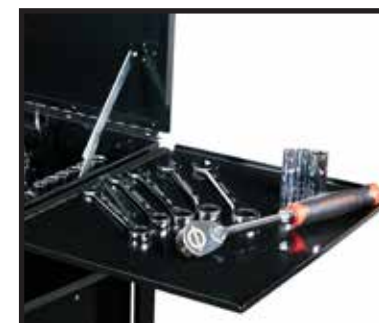
Black Folding Side Tray (Cart Only)