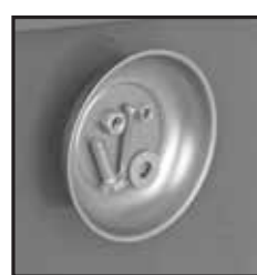
4 in. Magnetic Parts Holder