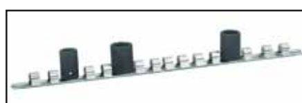
1/4 in. Socket Rail