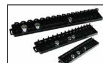
3 Piece Metric Socket Tray/Organizer