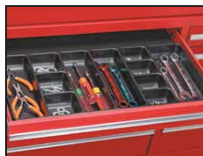
11 Compartment Organizer