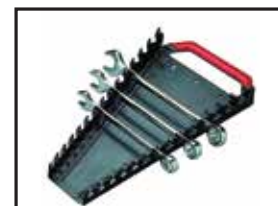
14 Slot Wrench Rack