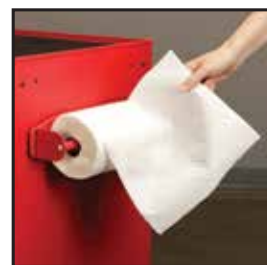
Paper Towel Holder